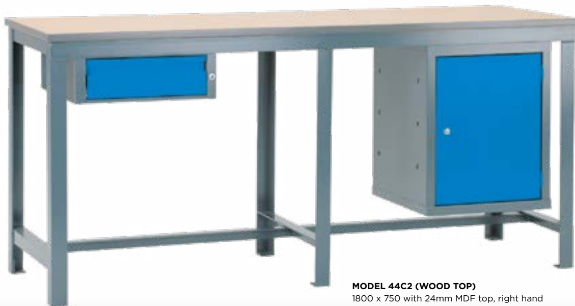
MODEL 44C2 (WOOD TOP) 1800 x 750 with 24mm MDF top, right hand cabinet and left hand drawer Order code: 44287A + PICTURED ACCESSORIES D1 Single drawer C1 Cabinet

Ideal for an engineering environment. These benches are of fully welded rugged construction, designed to take the everyday knocks of the industrial workplace. All workbenches are 840mm high as standard, other heights available. Frames Silver Grey (RAL 7001), Doors/Drawers Sky Blue (RAL 5015) as standard.