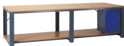
3000 x 1200 Starter workbench with MDF worktop, MDF base shelf and combined cabinet & drawer unit Order code: KDB3028BSA + CD1