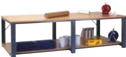
3000 x 1200 Starter workbench with MDF worktop and MDF base shelf Order code: KDB3028BSA