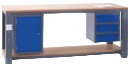
2000 x 700 Starter workbench with MDF worktop, MDF base shelf, cabinet, triple drawer & leg socket Order code: KDB2078BSA +C1 +D3 +LS1

ECONOMIC: This system offers great economic advantages over standard workbench sizes e.g. the 3000mm x 1200mm workbench (opposite) is the equivalent working area of 4 x 1500mm x 600mm workbenches.