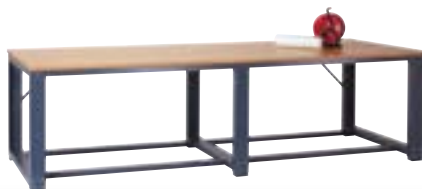
3000 x 1200 Starter workbench with MDF worktop Order code: KDB3028A