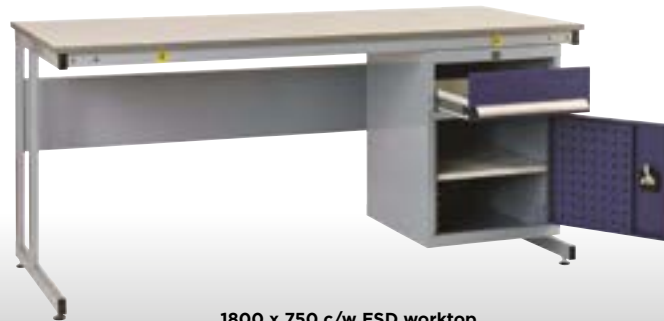
1800 x 750 c/w ESD worktop PW487G + PC2

Please note: Earth Bonding Points shown in image are an optional extra.