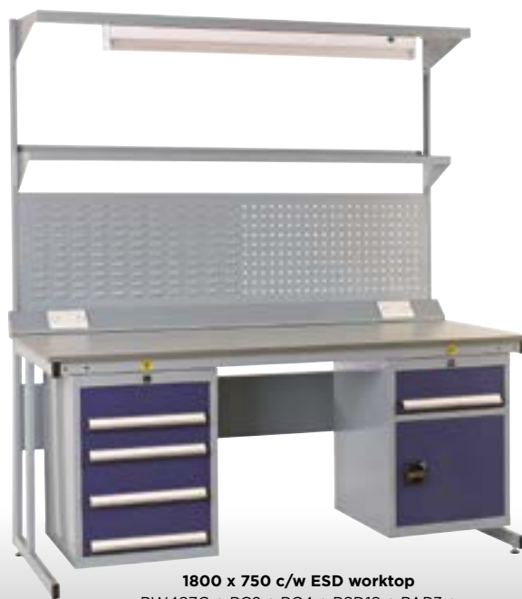
1800 x 750 c/w ESD worktop PW487G + PC2 + PC4 + PSD18 + PAP3 + PCP18 + PUSS18 + PLU18