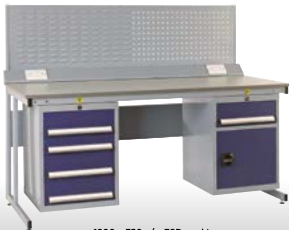
1800 x 750 c/w ESD worktop PW487G + PC2 + PC4 + PSD18 + PAP1 + PCP18

Please note: Earth Bonding Points shown in image are an optional extra.