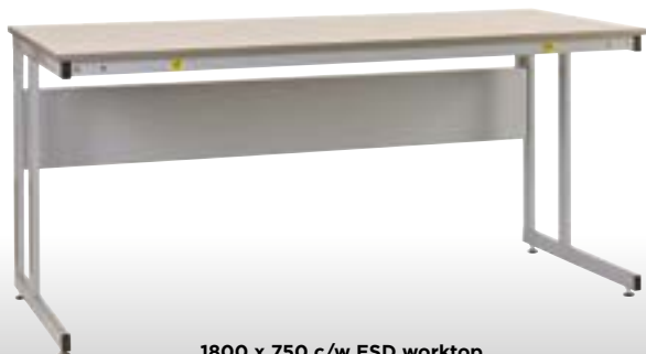
1800 x 750 c/w ESD worktop PW487G