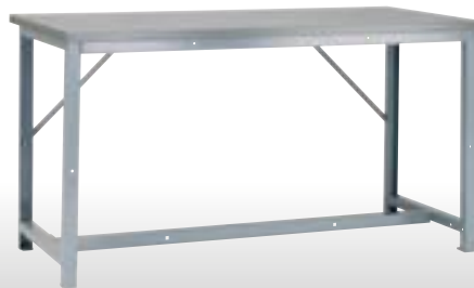
1500 x 600 c/w lino worktop PW156B

Simple flat pack assembly for a basic bench 600mm wide including all assembly fixings.