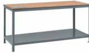
1800 x 750 c/w MDF worktop MD: 40187D + BS18 £350.98 HD: 44187A + BS18 £370.23