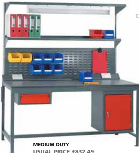
MEDIUM DUTY USUAL PRICE £832.49 SPECIAL OFFER £795.95

A comprehensive range of fully welded angle iron construction workbenches with a variety of worktop options and accessories. All workbenches are 840mm high as standard, other heights available. Popular models - available in all sizes from 1200mm long x 600mm wide to 1800mm long x 900mm wide. All workbenches are 840mm high as standard, other heights available.