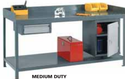
MEDIUM DUTY USUAL PRICE £540.46 SPECIAL OFFER £449.95