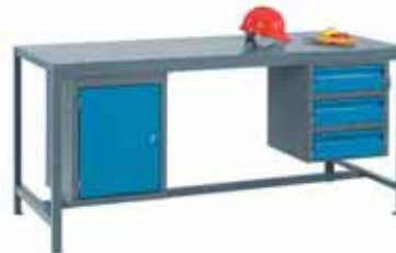
1800 x 750 c/w Steel worktop MD: 38187 + C1 + C3 £557.14 HD: 42187 + C1 + C3 £598.72