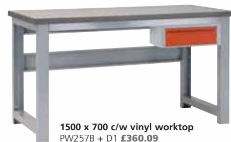
1500 x 700 c/w vinyl worktop PW257B + D1 £360.09