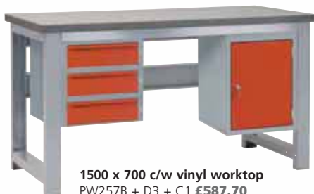
1500 x 700 c/w vinyl worktop PW257B + D3 + C1 £587.70