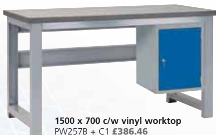
1500 x 700 c/w vinyl worktop PW257B + C1 £386.46