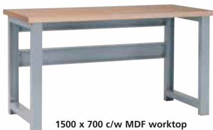
1500 x 700 c/w MDF worktop PW257C £204.92

C = 25mm thick plain cut MDF *Add C to end of order code