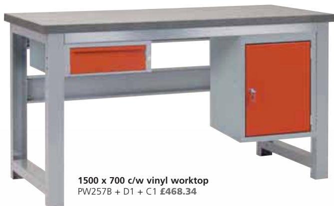
1500 x 700 c/w vinyl worktop PW257B + D1 + C1 £468.34