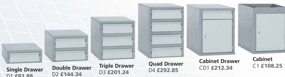
Single Drawer D1 £81.88