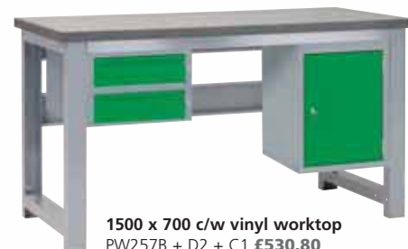
1500 x 700 c/w vinyl worktop PW257B + D2 + C1 £530.80