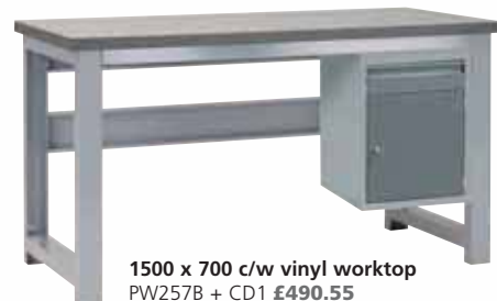
1500 x 700 c/w vinyl worktop PW257B + CD1 £490.55