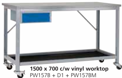
1500 x 700 c/w vinyl worktop PW157B + D1 + PW157BM + PW4SC £486.49