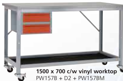
1500 x 700 c/w vinyl worktop PW157B + D2 + PW157BM + PW4SC £548.95