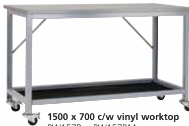
1500 x 700 c/w vinyl worktop PW157B + PW157BM + PW4SC £404.61