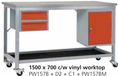
1500 x 700 c/w vinyl worktop PW157B + D2 + C1 + PW157BM + PW4SC £657.20