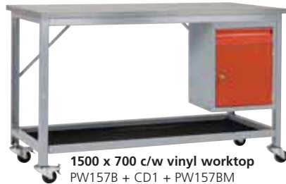
1500 x 700 c/w vinyl worktop PW157B + CD1 + PW157BM + PW4SC £616.95