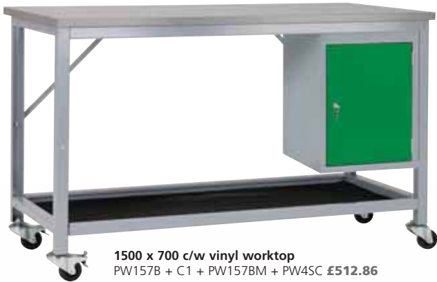
1500 x 700 c/w vinyl worktop PW157B + C1 + PW157BM + PW4SC £512.86

Take your workbench to the job with a mobile version of the prem-econ workbench system.