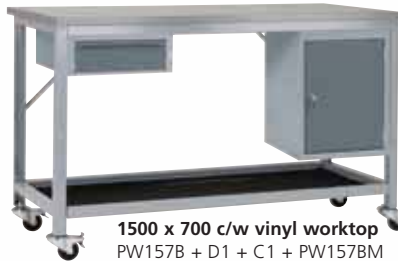
1500 x 700 c/w vinyl worktop PW157B + D1 + C1 + PW157BM + PW4SC £594.74