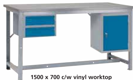
1500 x 700 c/w vinyl worktop PW157B + D2 + C1 £513.62