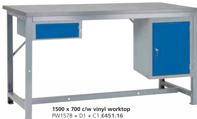
1500 x 700 c/w vinyl worktop PW157B + D1 + C1 £451.16