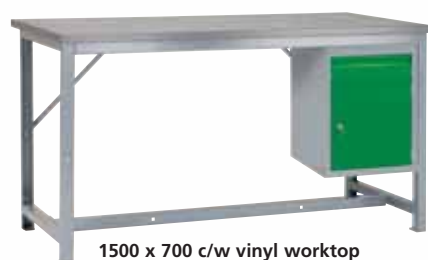
1500 x 700 c/w vinyl worktop PW157B + CD1 £473.37