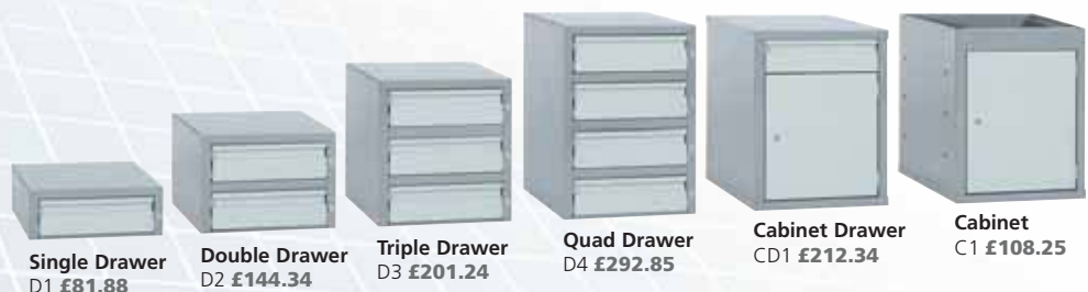
Single Drawer D1 £81.88