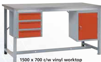
1500 x 700 c/w vinyl worktop PW157B + D3 + C1 £570.52