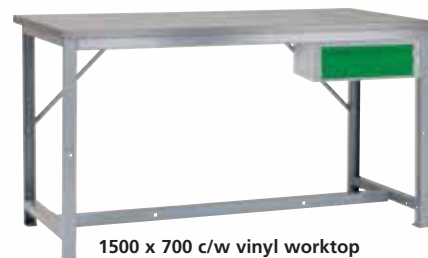
1500 x 700 c/w vinyl worktop PW157B + D1 £342.91