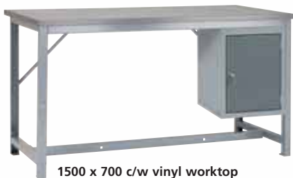
1500 x 700 c/w vinyl worktop PW157B + C1 £369.28