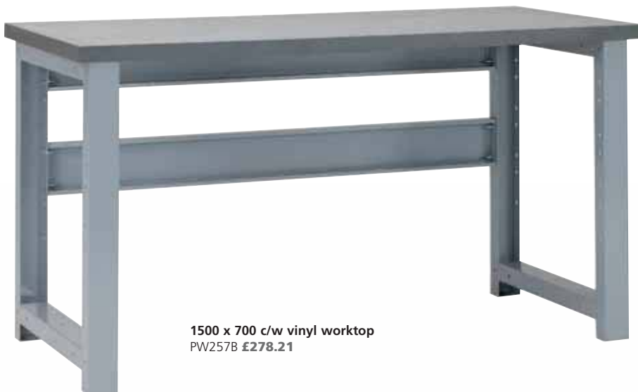
1500 x 700 c/w vinyl worktop PW257B £278.21