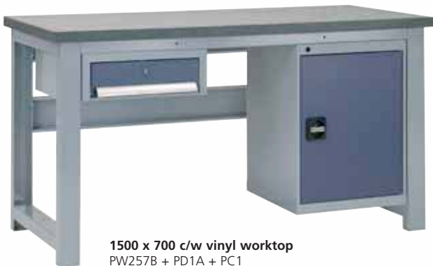
1500 x 700 c/w vinyl worktop PW257B + PD1A + PC1 USUAL PRICE £606.06 SPECIAL OFFER £589.95