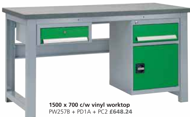
1500 x 700 c/w vinyl worktop PW257B + PD1A + PC2 £648.24

C = 25mm thick plain cut MDF *Add C to end of order code