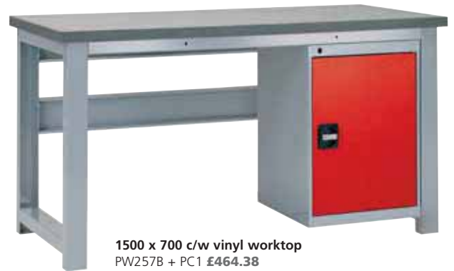
1500 x 700 c/w vinyl worktop PW257B + PC1 £464.38