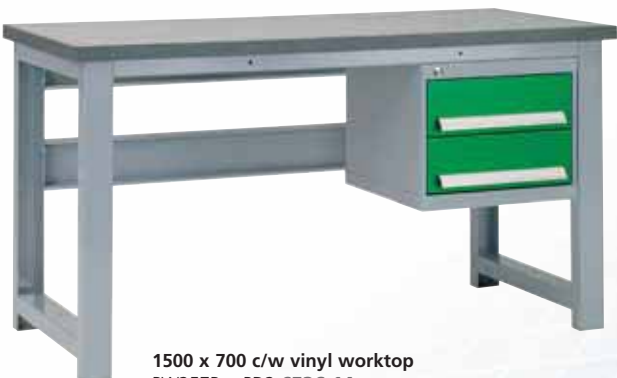
1500 x 700 c/w vinyl worktop PW257B + PD2 £526.14