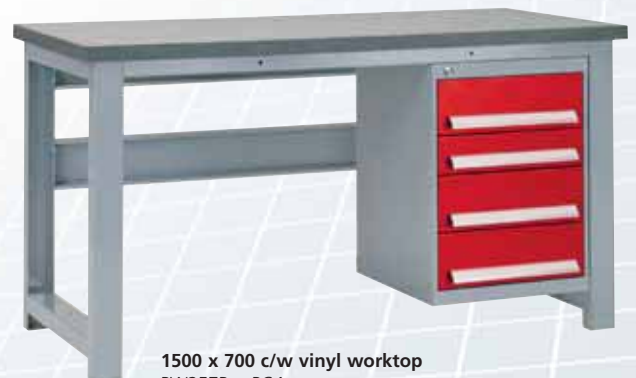
1500 x 700 c/w vinyl worktop PW257B + PC4 USUAL PRICE £651.51 SPECIAL OFFER £639.95