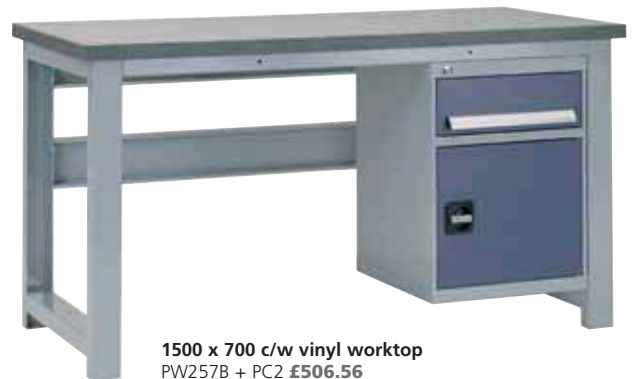
1500 x 700 c/w vinyl worktop PW257B + PC2 £506.56