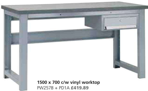
1500 x 700 c/w vinyl worktop PW257B + PD1A £419.89